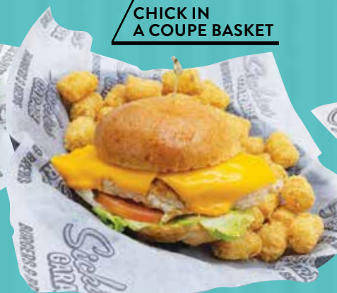
CHICK IN A COUPE BASKET