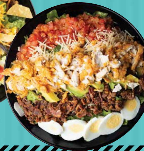
CALIFORNIA AVOCADO COBB