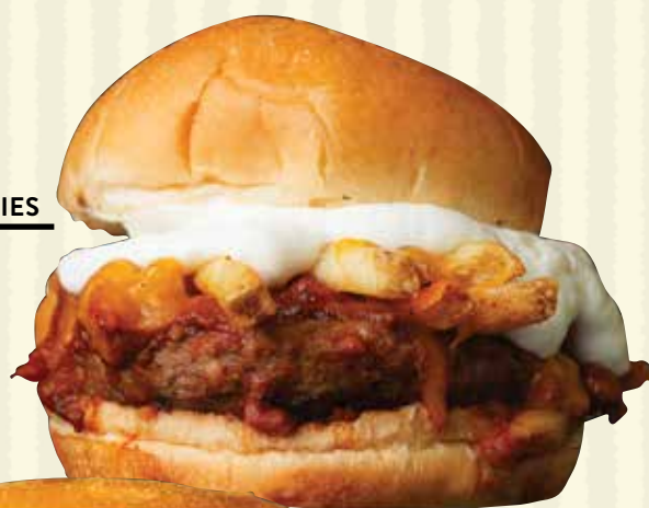
/ CHILI CHEESE FRIES

House made chili, fries, shredded cheddar and sour cream smothering our burger patty. 13.99