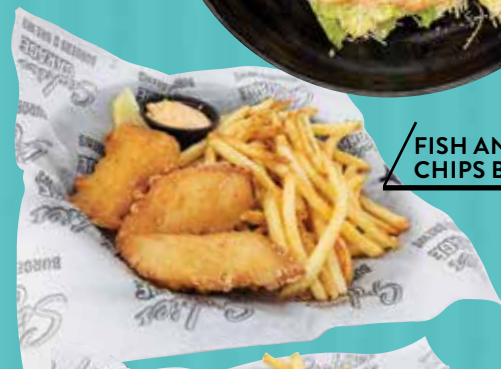
FISH AND CHIPS BASKET