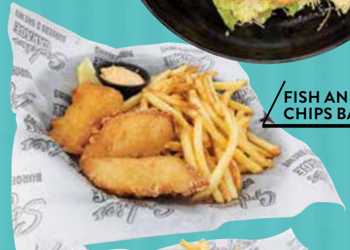
FISH AND CHIPS BASKET